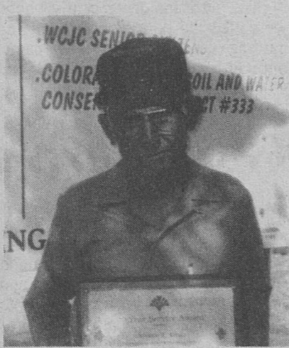
radio SWCD's representative to the Sam Houston RC&D where he serves on the board of directors.